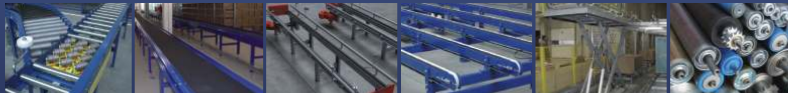
Driven roller conveyors